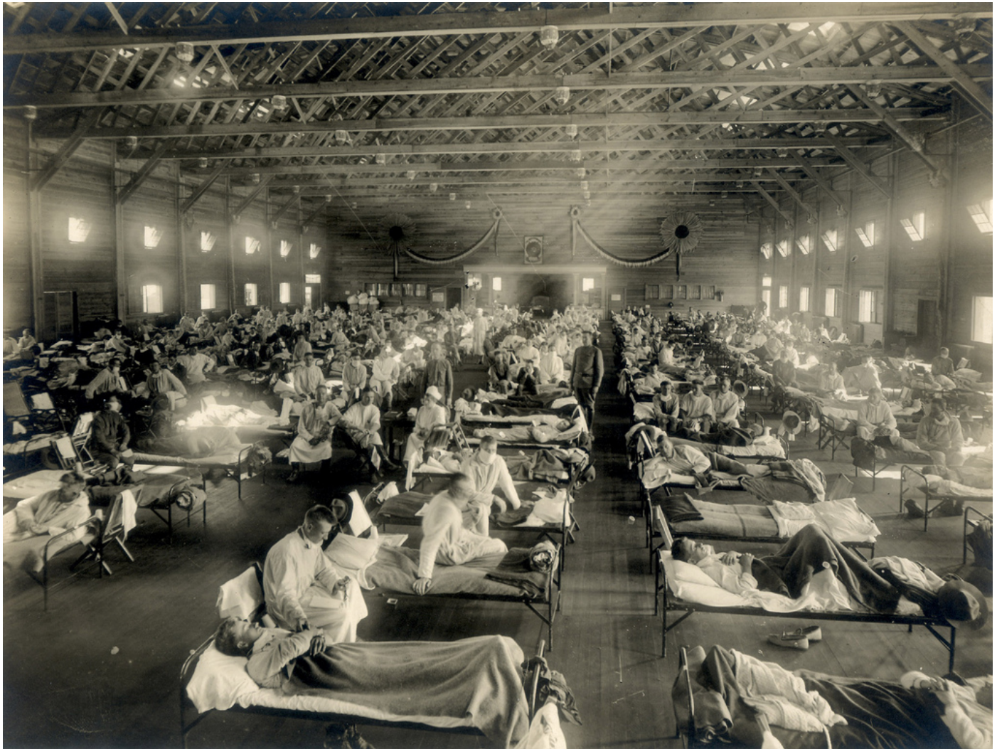
Soldiers from Fort Riley, Kansas, ill with Spanish influenza at a hospital ward at Camp Funston.