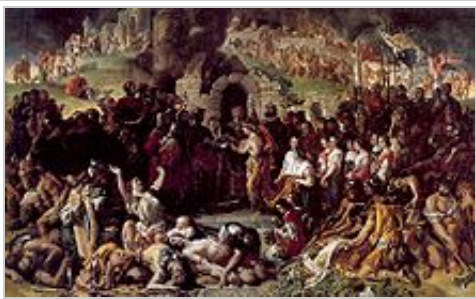
Daniel Maclise's painting of the marriage of Isabel's parents, Strongbow and Aoife of Leinster in August 1170, the day after the capture of Waterford.

Isabel was born in 1172 in Pembrokeshire, Wales, the eldest child of Richard de Clare, 2nd Earl of Pembroke (1130 – 20 April 1176),