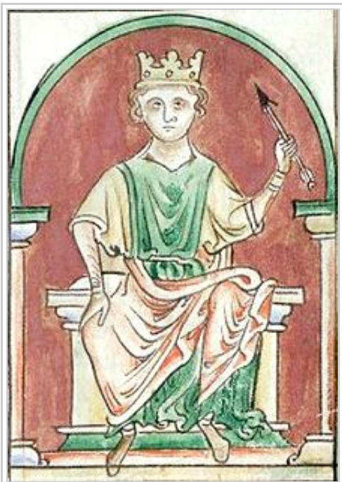
William Rufus, "the Red", King of the English (1087–1100).