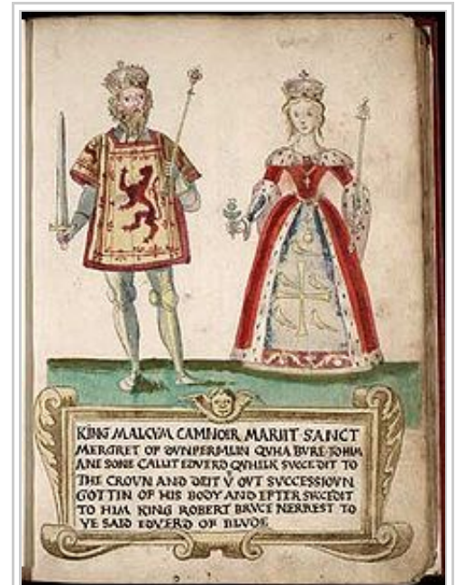
Máel Coluim and Margaret as depicted in a 16th-century armorial. Note the coats of arms both bear on their clothing — Malcolm wears the Lion of Scotland, which historically was not used until the time of his great-grandson William the Lion; Margaret wears the supposed arms of Edward the Confessor, her grand-uncle, although the arms were in fact concocted in the later Middle Ages.