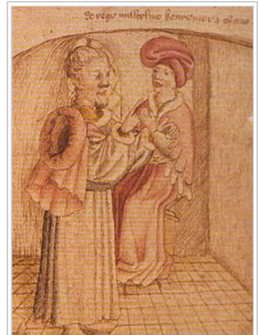
Late medieval depiction of Máel Coluim III with MacDuib ("MacDuff"), from an MS (Corpus Christi MS 171) of Walter Bower's Scotichronicon .

Malcolm's marriage to Ingibiorg secured him peace in the north and west. The Heimskringla tells that her father Finn had been an adviser to Harald Hardraade and, after falling out with Harald, was then made an Earl by Sweyn Estridsson, King of Denmark, which may have been another recommendation for the match. [38] Malcolm enjoyed a peaceful relationship with the Earldom of Orkney, ruled jointly by his stepsons, Paul and Erlend Thorfinnsson. The Orkneyinga Saga reports strife