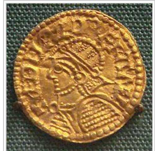
Gold mancus of Æthelred wearing armour, 1003–1006.

Edward reigned for only three years before he was murdered by members of his brother's household. [13] Though we know little about Edward's short reign, we do know that it was marked by political turmoil. Edgar had made extensive grants of land to monasteries which pursued the new monastic ideals of ecclesiastical reform, but these disrupted aristocratic families' traditional patronage. The end of his firm rule saw a reversal of this policy, with aristocrats recovering their lost properties or