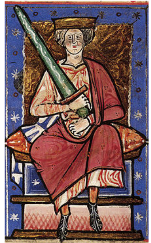
King of the English