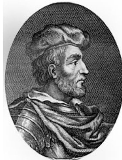
Anachronistic depiction of Duncan I by Jacob de Wet, 17th Century