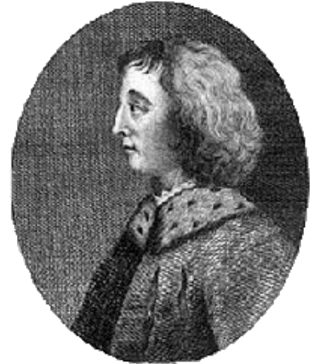
Fanciful 17th century depiction of the king; his actual appearance is unknown