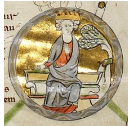
King of the English