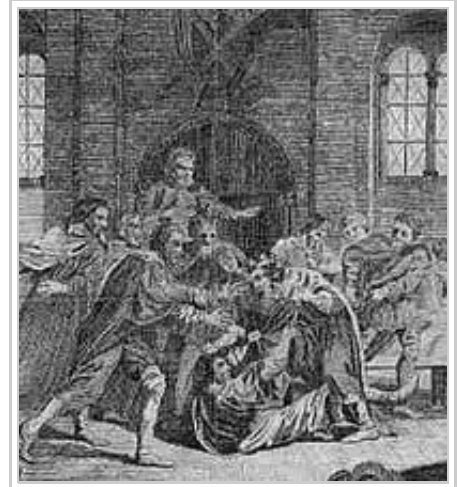
"The Murder of King Edmund at Pucklechurch", drawn by R. Smirke, published in Ashburton's History of England, 1793