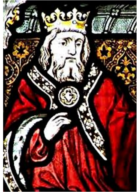
Arnulf I, Count of Flanders